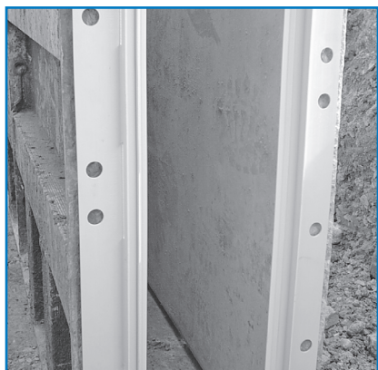
Place on each side of wall, directly opposed to each other.