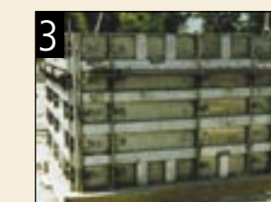
3 Set Exterior Panels & Pour Set the jacket and align panels by using 2x4 walers around the top of the formwork.