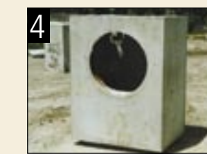
4 Strip & Ship to Customer The next morning, easily and quickly strip the forms and deliver a top-quality product to your customer.