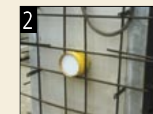
2 Add Rebar & Blockout Tie the reinforcing steel and insert void material.